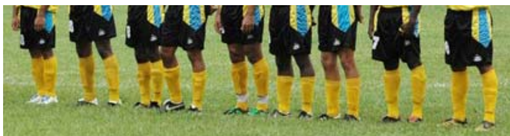
Bahamas high school football: nurturing ground for national players of the future