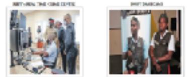
21 st Century Technology Investments