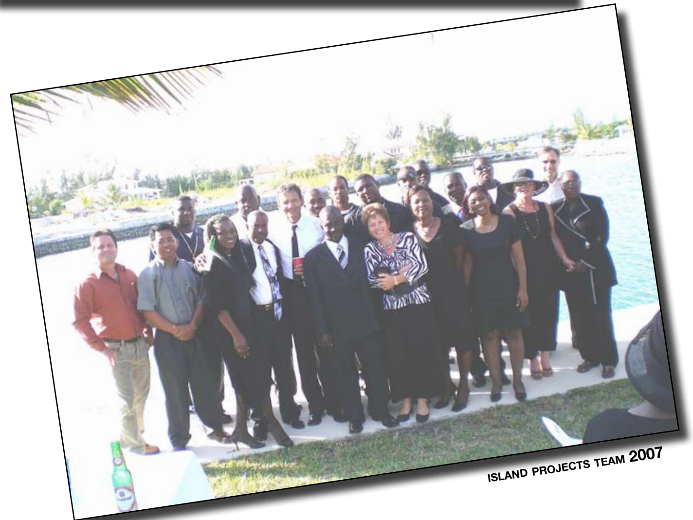
ISLAND PROJECTS TEAM 2007